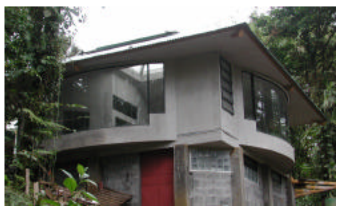
Construction of the café in July 3003