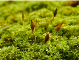
scientific inventories of the cloud forest flora and fauna