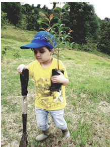
activities for recruiting and training future native plant forester such as the young man at left with the oversize shovel and cloud forest tree seedling.